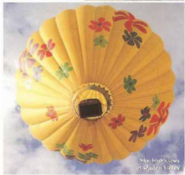
Sky-high views of Ogden Valley