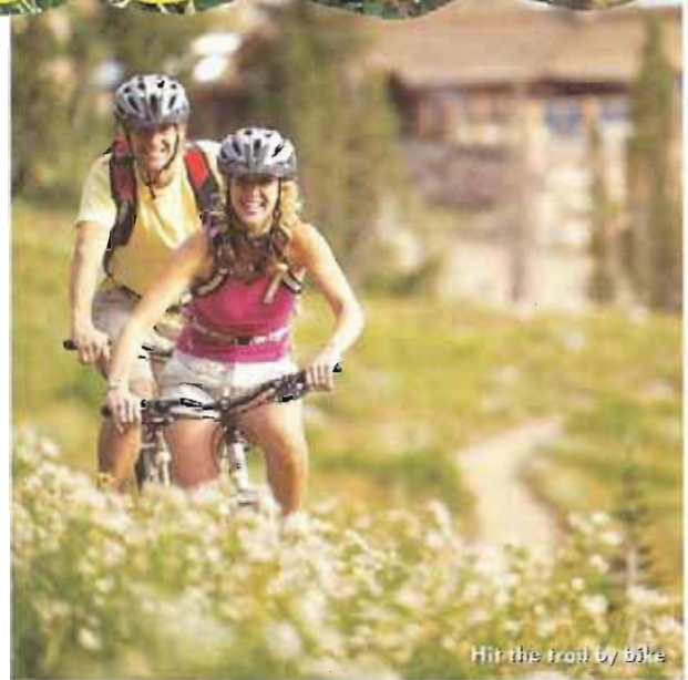
Hit the trail by bike

The Eden General Store & Diner. WHAT: An 1890s dance hall turned diner serving up coconut cream pie. WHEN: Breakfast and lunch daily, dinner Mon–Sat. HOW MUCH: $$$. WHERE: 5510 East 2200 North, Eden; 801/745-2400. —VIRGINIA RAINEY