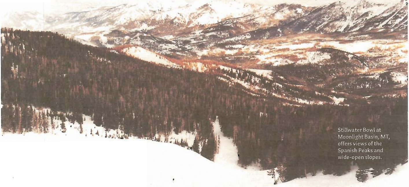
Stillwater Bowl at Moonlight Basin, MT, offers views of the Spanish Peaks and wide-open slopes.